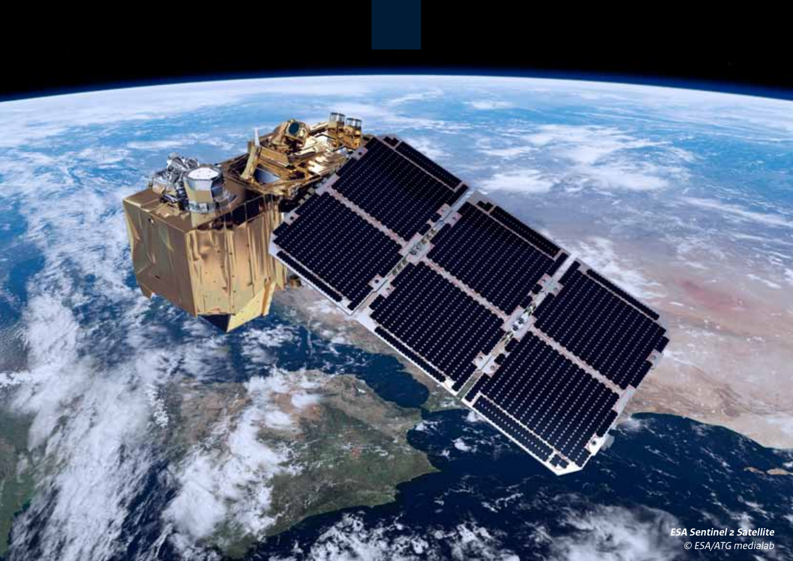
ESA Sentinel 2 Satellite